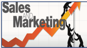
Marketing & Sales