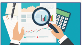
Audit & Compliance