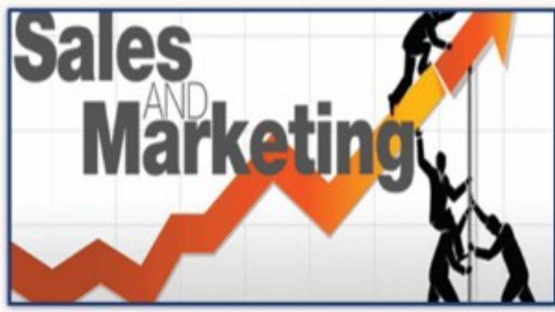
Marketing & Sales