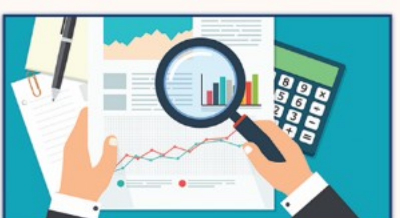
Audit & Compliance