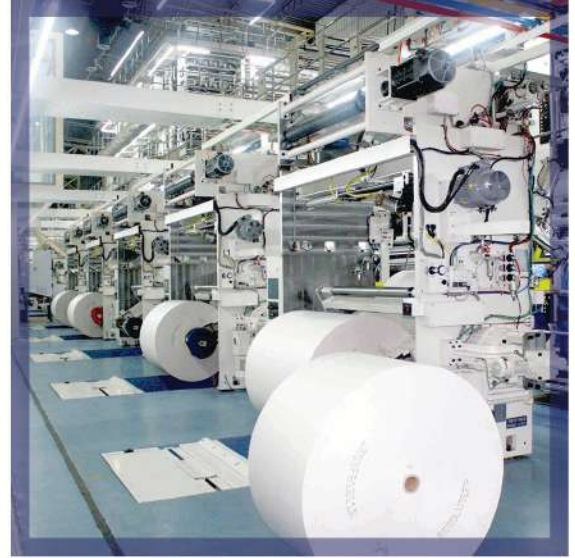
10. PAPER & PULP