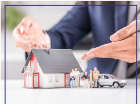
INSURANCE MANAGEMENT SYSTEM