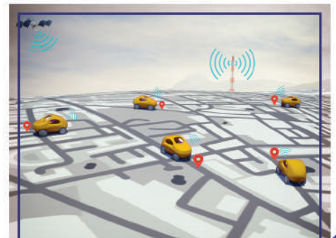
VEHICLE TRACKING SYSTEM