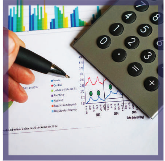
2. FINANCIAL SERVICES