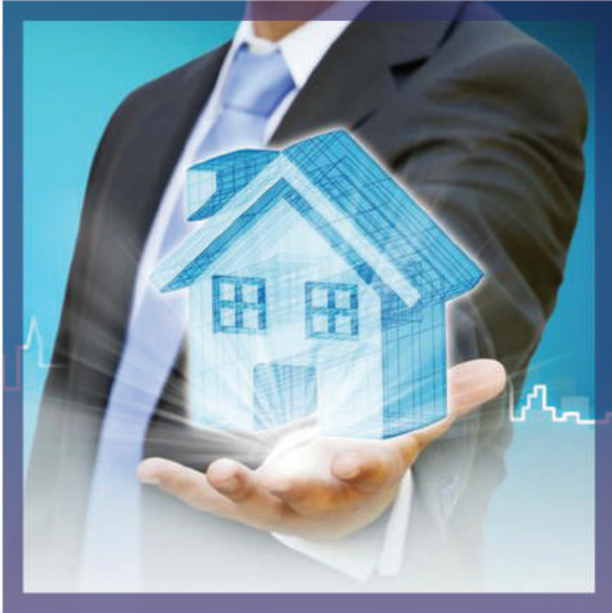
5. REAL ESTATE