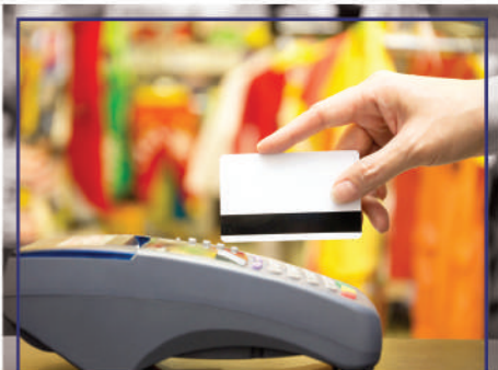
AMITY'S SMART VALUE PLUS