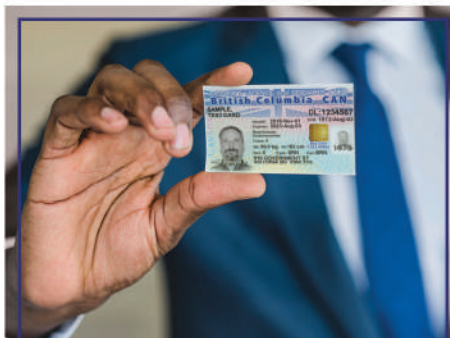
SMART CARD & RFID PROJECTS