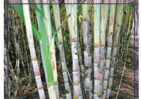
CANE MANAGEMENT SYSTEM