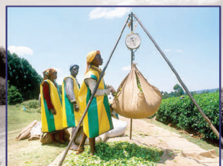
FIELD WEIGHMENT SYSTEM (FWS)