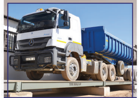
SMART WEIGHMENT SYSTEM