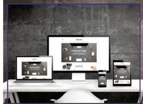
WEBSITE & MOBILE APP DESIGN, DEVELOPMENT & MAINTENANCE