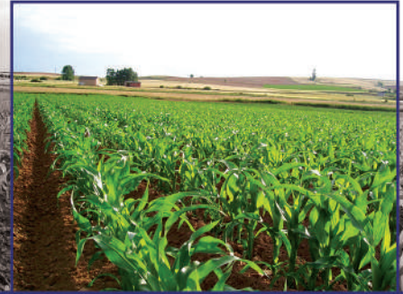
AGRICULTURE MANAGEMENT SYSTEM