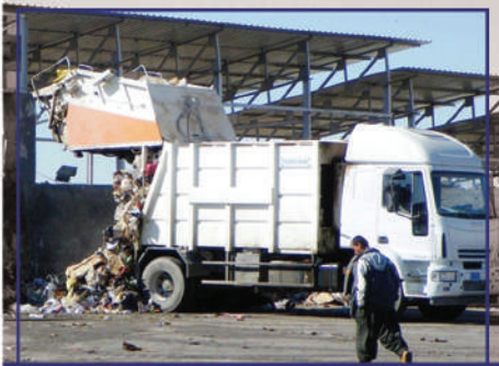
SOLID WASTE MONITORING SYSTEM